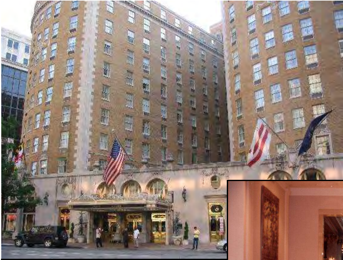
Mayflower Hotel Washington, DC