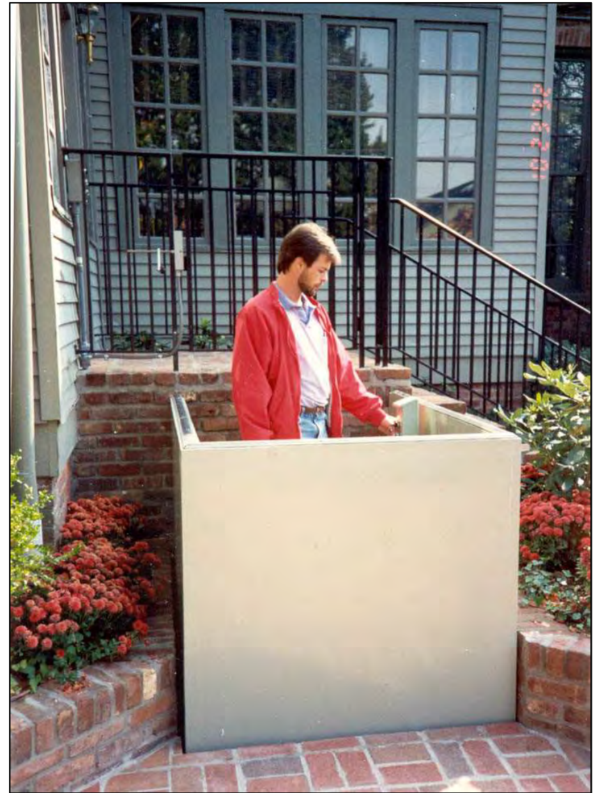
Retractable lift meets the Standards