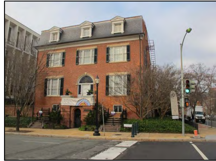
2 - to yard