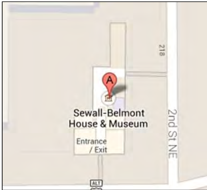
1 - to rear