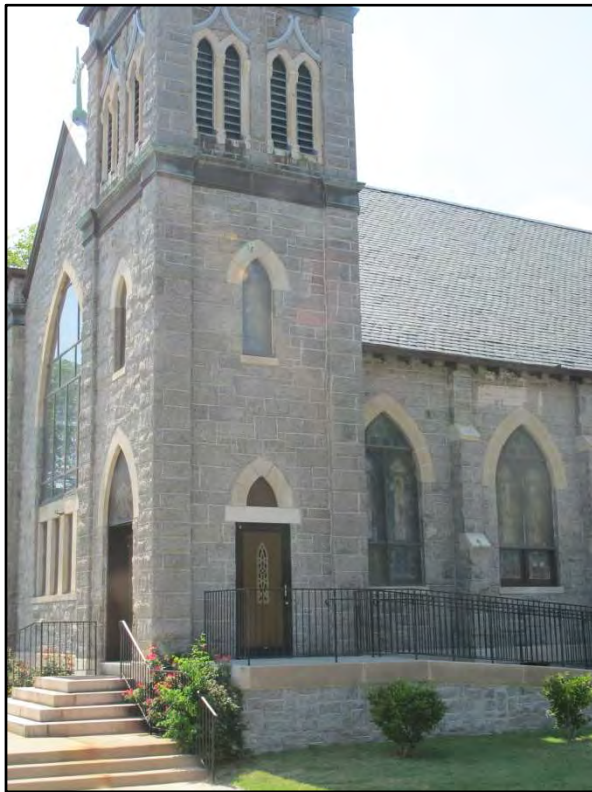
Simple ramp at side elevation meets the Standards Church, Fort Monroe Hampton, VA